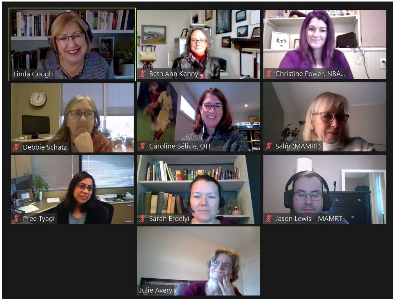
The Alliance Board of Directors and guests at the November 16 th Zoom Board meeting